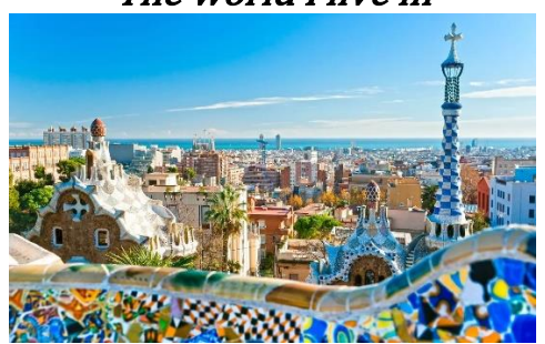
Bapuant V The world I live in